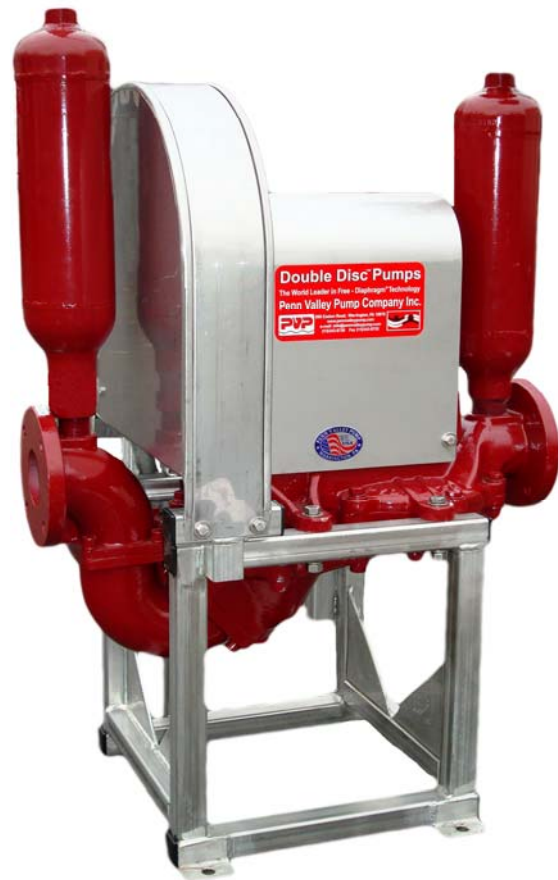
The Ultimate in Sludge Pumps™